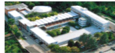
REGIONE FRIULI VENEZIA GIULIA Polo di San Vito (Pn) e Pasiàn di Prato (Ud)