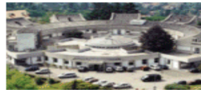
REGIONE VENETO Polo di Conegliano e Pieve di Soligo (Tv)