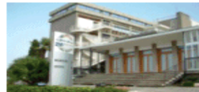
REGIONE PUGLIA Polo di Ostuni (Br)