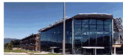
REGIONE LOMBARDIA Polo di Bosisio Parini (Lc)